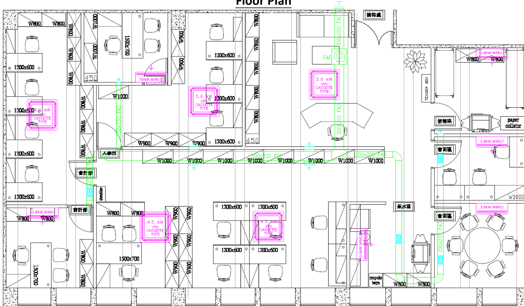
Hen Wing, 13/F